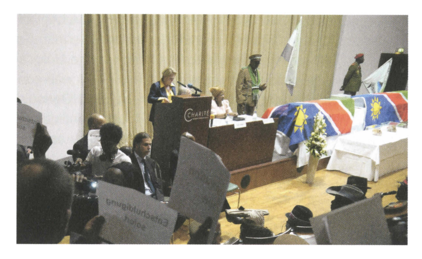
Handover ceremony of Nama and Ovaherero skulls at the Charité, Berlin, September 30, 2011 (see also pp. 138–142)

Dierk Schmidt: The "curse" of the mummy hits those who open the burial chamber. The mummy, removed from its context by violence, revolts. It becomes an active figure with knowledge of both worlds; namely the Ancient and the Now, Egypt and Europe. It acts within, with, or against the museum. From this, we have derived the concept of "self-restitution," an archaeological object transferred to a subject, in some plots remotely controlled, in others acting independently.