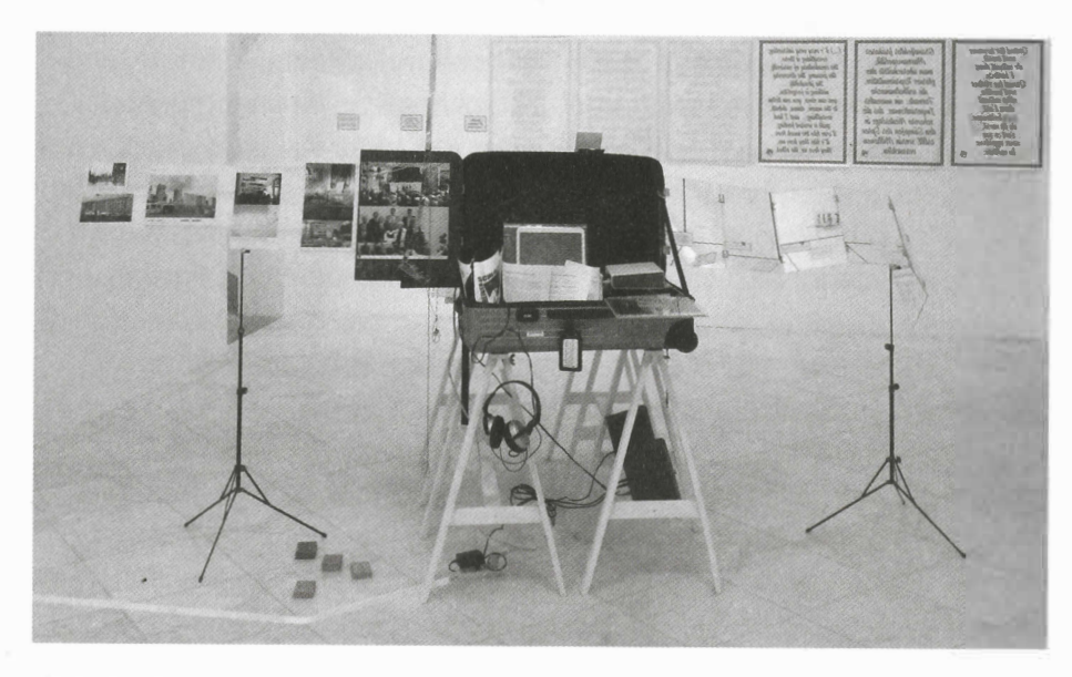
Artefakte//anti-humboldt The Anti-Humboldt Box, Villa Romana, Firenze, 2015

Central to Artefakte's activities was their investigation into German ethnographic collections and processes of restitution of human remains. They have particularly focused on objects in Berlin museums with a past troubled by violent or criminal acquisition, racist science, or colonial provenance, and the ways in which such power relations are counteracted or continue to be enacted in the present.